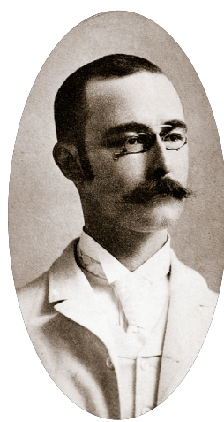
Above: Newspaperman N. G. Gonzales, who cofounded The State newspaper with his brother Ambrose, was brutally murdered in broad daylight by South Carolina Lieutenant Governor James Tillman. Tillman blamed Gonzales, with justification, for his defeat in the governor’s race.

A less deadly but more lasting problem in South Carolina was pellagra. First diagnosed in the mid-eighteenth century, pellagra was a disease that caused diarrhea, mental depression, and skin disorders that left permanent bleached-out blotches on the skin. Mill villages had the highest rate of pellagra. Studies in Spartanburg County mills supported the idea that poverty and poor diet caused the disease. Poorer workers were twelve times more likely to get pellagra than the higher-paid workers who could afford a better diet. Mill hands tended to eat a steady diet of corn meal, salt pork, and molasses. Add green vegetables, milk, eggs, and fresh meat, and the disease did not occur.