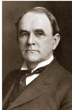
Above: The administration of Governor Richard I. Manning was progressive on labor law, and established the State Tax Commission and the Highway Commission.

champion of the mill workers and the poorest white sharecroppers. Yet he consistently blocked progressives' efforts to improve workers' conditions. He vetoed state inspections of factories to improve sanitation and safety. He opposed regulating hours of labor. (Workers should be able to decide such matters for themselves, he said.) Blease also opposed laws regulating child labor, requiring school attendance, or allowing physical examinations of school children.