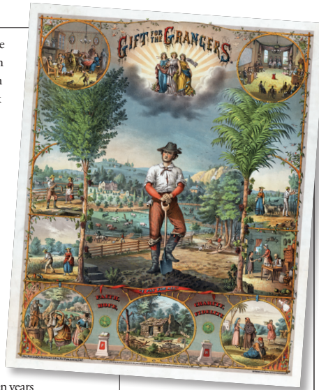
Above: Country stores sometimes hosted meetings of local organizations like the Grange, a fraternal organization of farmers that promoted their interests. Below: Although cotton was still by far the dominant crop in South Carolina, there was more diversification. This is a field of Irish potatoes near Charleston.

Cotton crops increased during the first decade, peaking at an all-time high of 1.6 million bales in 1911. Surprisingly, the price the farmers received also went up a bit. In 1914, cotton was bringing thirteen cents per pound, a decent price. World War I began that year in Europe and spurred demand for cotton products, such as uniforms and tents. Cotton prices went up sharply. Encouraged by new demand, farmers bought more land and equipment, on credit. The price of cotton went to forty cents per pound in 1920. Most farmers were feeling pretty good.