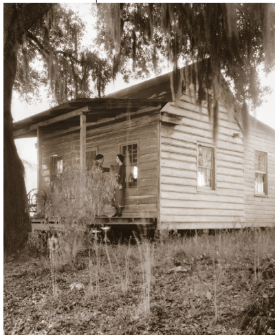
Section 1: Life at the Turn of the Century 365