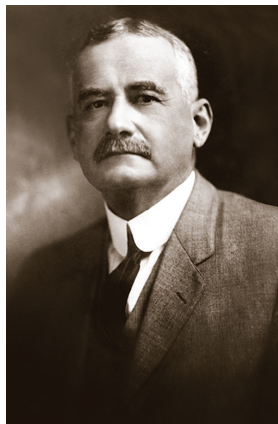
Above: Duncan Clinch Heyward was a political newcomer when he ran for governor in 1902. He won the backing of Benjamin Tillman because of his support for the Dispensary, and was re-elected to a second term in 1904.

Progressivism took a recess during the two terms of Governor Coleman L. Blease, 1911-1915. A lawyer from Newberry, Blease called himself the