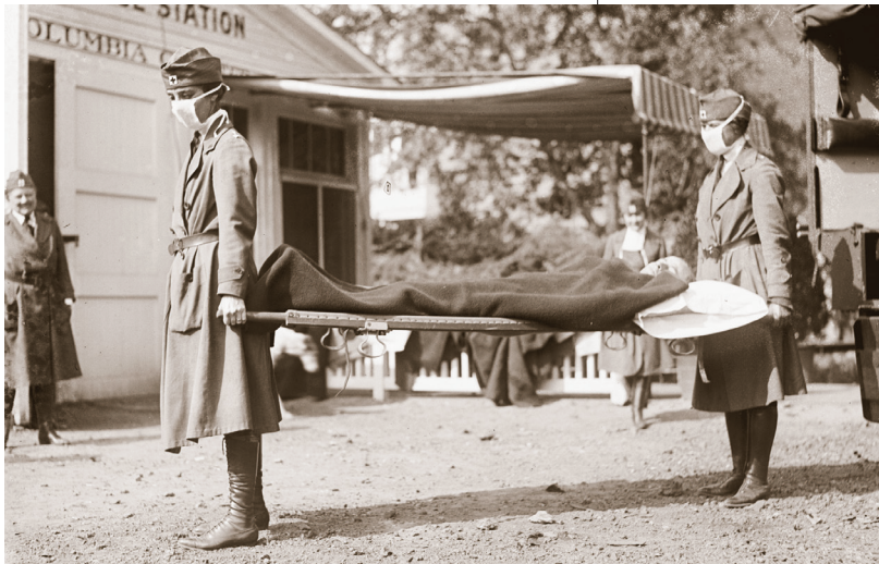
Section 1: Life at the Turn of the Century 373

Below: The Spanish influenza pandemic of 1918-1919 killed many more people than had died in World War I. It has been theorized that the pandemic started at an army base in Kansas and was spread to Europe by American troops. From there it spread around the world, killing millions of people. This photograph shows a demonstration at the Red Cross Emergency Ambulance Station in Washington, DC, during the pandemic.