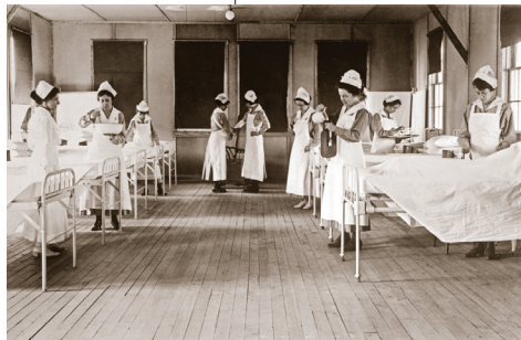
Top: The 115th Field Artillery poses for a regimental portrait at Camp Sevier near Greenville. Above: Camp Wadsworth was one of the locations of the Army School of Nursing, which trained nurses for service in World War I.

The League of Nations was established, with halfhearted European support and too little American support. Wilson's vision was unacceptable to the Republican Party's isolationists (those who wanted the United States to isolate herself from the age-old struggles of Europe and just tend to our own business). Isolationists in the Senate voted down the League of Nations and rejected the Treaty of Versailles. A sad Woodrow Wilson predicted another great world war within a generation. (World War II started twenty years later.)