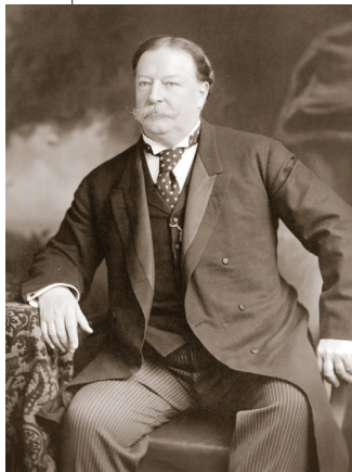
Above: William Howard Taft is the only president to have also served as chief justice of the United States. He was appointed to the post in 1921.