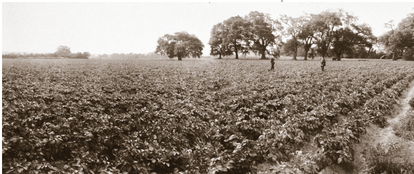
Section 1: Life at the Turn of the Century 367