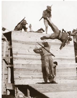
Above: Members of the National Guard practice scaling a wall as part of their training for combat in World War I at Camp Wadsworth, near Spartanburg.

that migration became a flood as blacks were repelled by their treatment in the South and were attracted by better-paying jobs in the North.