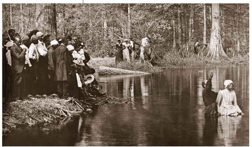
Above: Photos like this one of a baptism were often sold as postcards depicting life in the South.