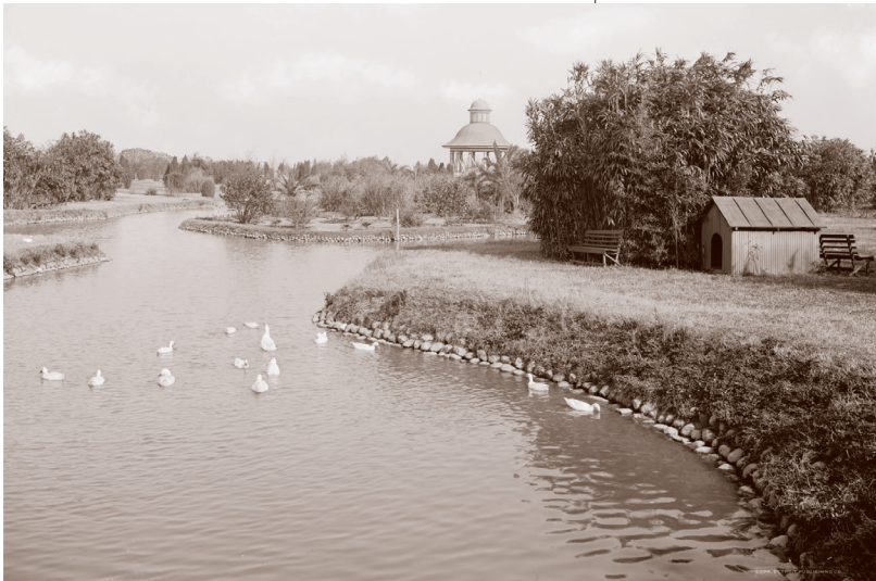
Section 2: Politics in the Progressive Era 377

Below: Hampton Park in Charleston was created in 1907 and named for Wade Hampton III. It occupied land that had been, at various times, a plantation, a horse race course, a Civil War prisoner-of-war camp, and the site of the South Carolina Inter-State and West Indian Exposition.